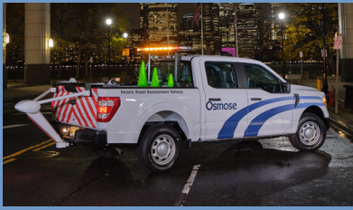
Survey underground for fault conditions