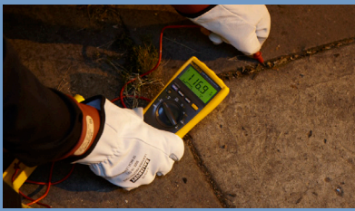
Record observations and measurements at fault locations